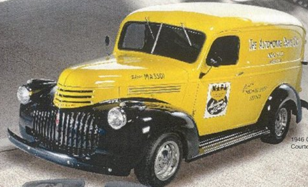
1946 Chevrolet Panel Delivery